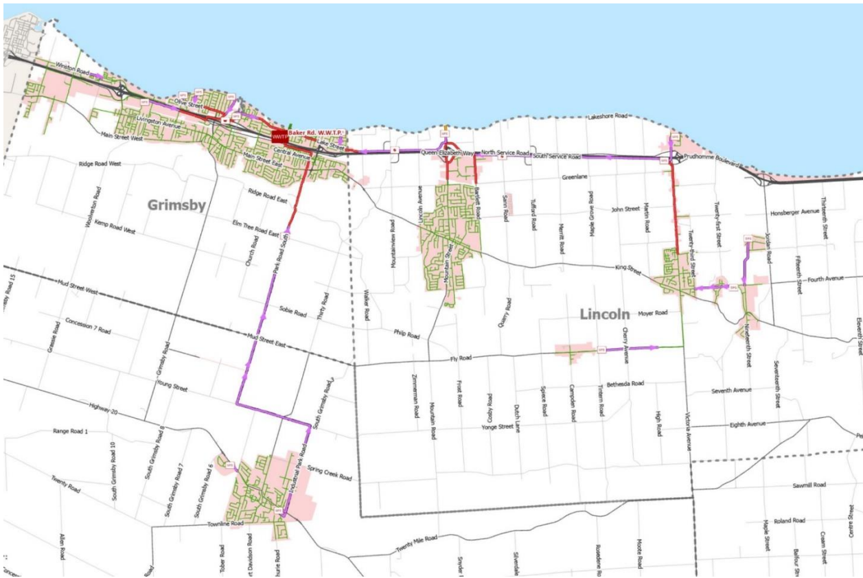
Figure BR-C-1: Map of Baker Road WWTP Collection System

The collection system is operated under a two-tier system, where the Town of Grimsby, Town of Lincoln and Township of West Lincoln own and operate local gravity sanitary sewers and Niagara Region owns and operates sewage pumping stations, forcemains and larger gravity sanitary sewers or trunk sewers. It is classified as a nominally separated system meaning that storm water is collected separately from sanitary sewage but the system may still be impacted by inflow and infiltration from sources such as roof leaders, foundation drains, leaky pipes and joints and maintenance holes.