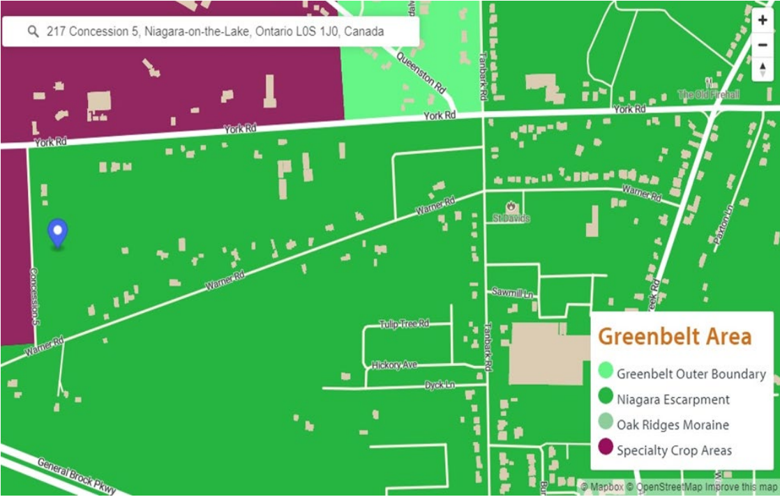
Figure 1: Greenbelt Map