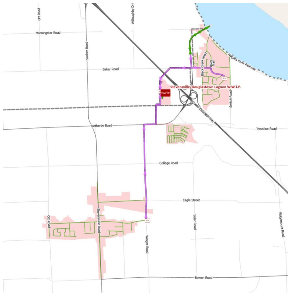
Figure SD-C- 1: Map of Stevensville-Douglastown Lagoon Collection System